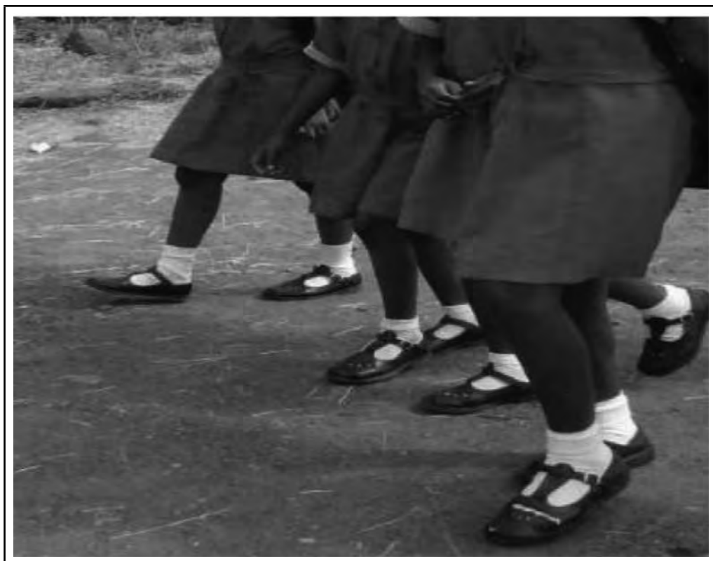
Figure 3: Picture 3

I have been wearing this pair of shoe for two years and now it is torn. When I see a student looking at my feet (shy smile) I feel embarrassed. I enjoy being with my friends, because they do not laugh at me, but other learners do. Unfortunately my friends are in a different class (Grade 6B), so most of the time, to avoid the scorns and mocking from my classmates, I prefer being alone.