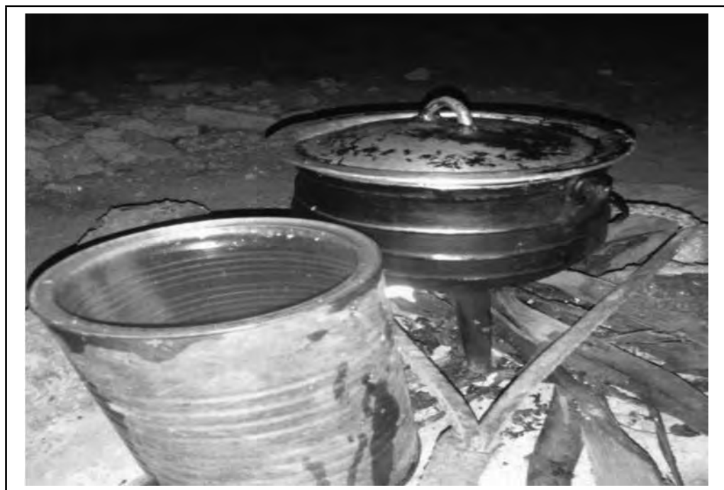
Figure 1: Picture 1

Precious also provided the picture below to illustrate her strength of character as she gets ready for school in the morning.