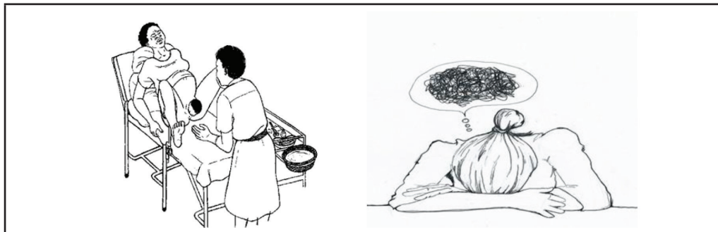
Figure 1 and Figure 2: Drawings in reflective commentary by Naledi Nkabinde, fourth year medical student at UCT

In my role as a facilitator of student learning, I felt emotionally drained by reading and listening to the collective narratives of students' experiences as described above. How could their reflections contribute to changing practices rather than stay bounded simply as curricular tasks for hand-in?