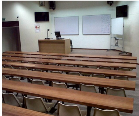
Figure 1: A photo of a lecture hall (student 2)

of the economic (maldistribution of resources) with the cultural (misrecognition through the devaluing of her race/ethnicity and mother tongue):