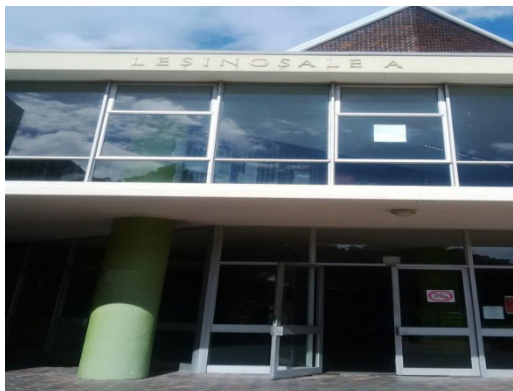
Figure 2: A photo of the university building marked “Lesingsale A” (student 103)

... back in 2012 while I was doing my first year. ... The building is marked in Afrikaans, it reads “Lesingsale A,” and this in English translates to Lecture Hall(s) A. Being a black female student, from the Eastern Cape who at the time had challenges in understanding the Afrikaans language, getting around the campus was a bit of a struggle. At high school I did not do Afrikaans as a subject, I did IsiXhosa as my first home language and English as my second language. I still remember the first final semester examination that we sat for was written in the A-block venue. At the time I used to travel with the bus and I used the main gate entrance by foot. On the day of the examination I had to look for the A-block and could not find it ... I believe that had this building been written or marked in a language that would not be a barrier it would have been easier. I felt disempowered by this experience. (student 103)