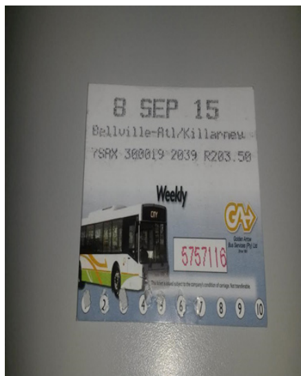
Figure 5: A photo of a bus ticket (student 82)

I feel disempowered ... Because where I live ... this bus service just drive at certain times in the mornings and in the afternoons and it takes me an hour and half to get to campus each and every day. Even if my classes starts late in the morning I still have to get up at 5 clock to get the bus at 6 clock cause that's the only bus that's available to get to Belleville and if I have one class that I have to attended to I have to wait till 4 clock in the afternoon to get the bus home cause that's the only bus ... I pay every week R203.50 for a bus ticket to make use of this bus service and when I don't have classes or something I lose money on this ticket because you can just use it to a certain date. ... [s]ometimes the bus is so full I have to stand ... while others that come with their cars have so much more comfort and benefits ... And when I miss this bus there is no other way to come to campus. (student 82)