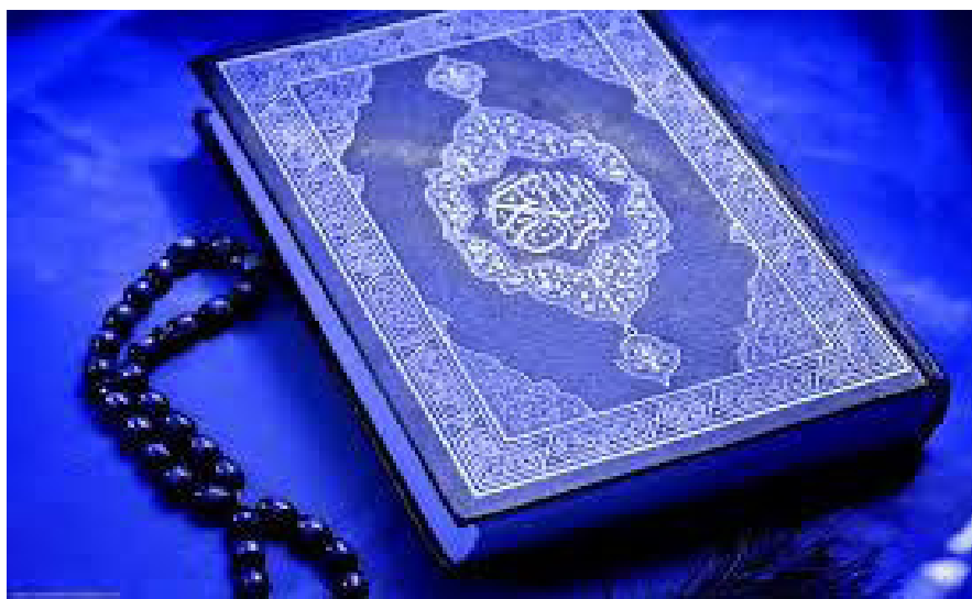
Figure 6: A photo of a Quran (student 25)

In the narratives discussed so far students have drawn attention to a wide range of identities structured around class, age, race, ethnicity and language as well as gender and sexuality that illustrate exclusion built around maldistribution and misrecognition. Religion also emerged as a significant axis of exclusion and misrecognition for some students. While a substantial number of students would identify as Christian, there is a fairly substantial minority of Muslim students as well as a few other religions on campus. Not one of these students, however, drew attention to ways in which the academic week, term, semester and year was structured around the holidays of one religion. But if an academic calendar predicated on Christianity was accepted as normative, there were other ways in which Muslim students experienced a devaluing of their religious identities. In the narrative below, student 25 shows how her gender and religion are devalued and how they combine to preclude the possibility of her participating equally with other students: