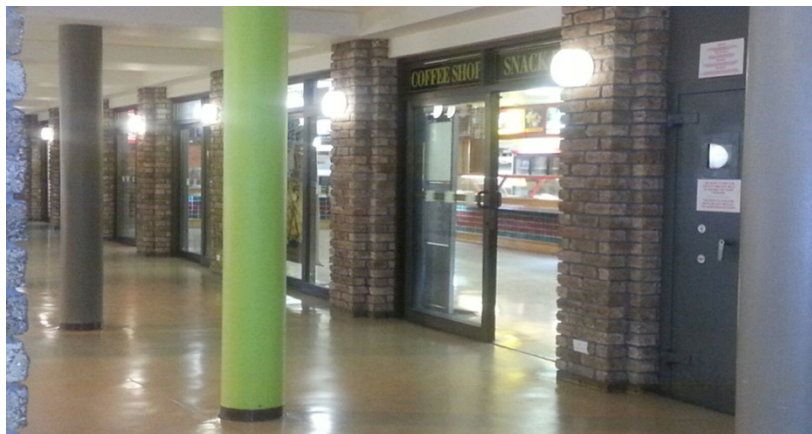
Figure 4: A photo of the student centre (student 65)

... at Khayelitsha, I used to buy a filling large “iGwinya elinesbindi” (Vetkoek with chicken livers) for a mere R5.00 or I could also buy a braaied meat or sheep liver from as little as R15.00. When I arrived at the University of the Western Cape in 2013 we were introduced to some of the places where most students “hung out,” the student centre happened to be one of those places. I felt so deeply disempowered when I had to buy food from the two shops at the student centre, I could not get anything worthy of being called “food” that cost under R15.00, two slices of toast and an egg cost R25.00. Now this could seem like something not worthy of note in terms of disempowering issues, but I looked around me and I saw that other students around did not seem to mind the exorbitant prices of food. Right at that moment I felt like I was out of my depth and I did not belong to this place. Feeling the pressure of wanting to fit in with my peers and not wanting to stand out as the “poor guy” I spent my last R50.00 on the two slices of toast and egg and a R15.00 cup of coffee, the remaining change was for the train fare. (student 65)