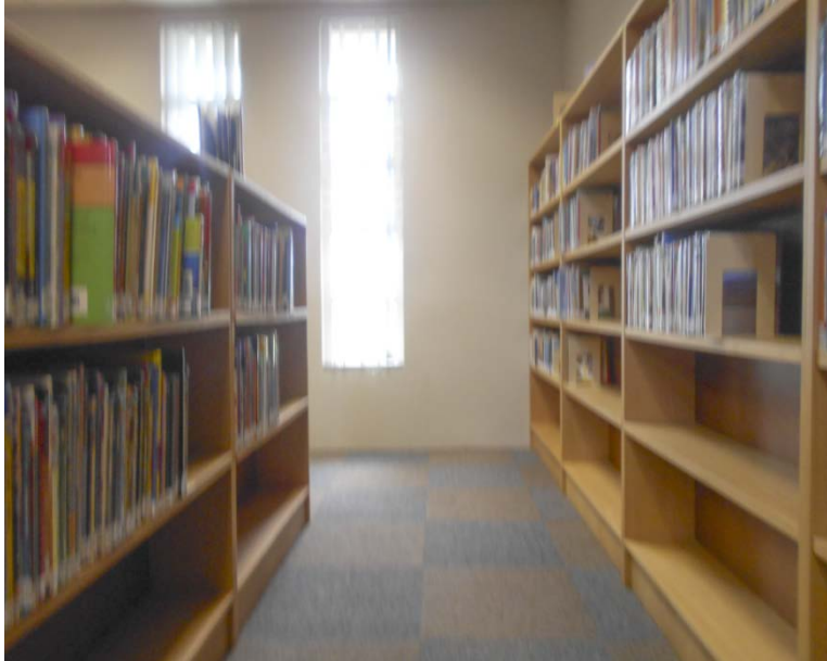
Photograph 2: “It’s leading me into seeing my future”

What I like about this picture, it is leading me into seeing my future ... [I]n order to be successful, I need to study books, and this is the proof of what I am doing in my public library area. And I make use of it when at home.