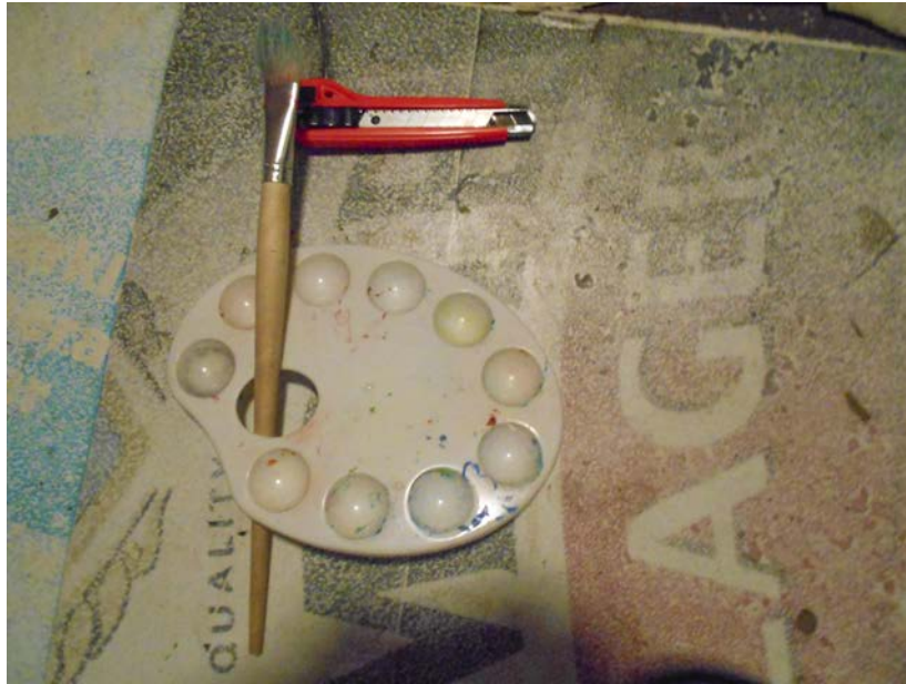
Photograph 4: “So everything that I am doing I must show myself that I am an artist”