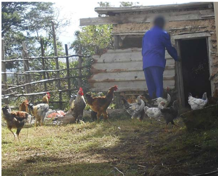
Photograph 1: "They know that this man is having food that we need"

Always forecast who has more information about that thing you would like to have. So that's why chickens, they are following a man, because they know that this man is having food that we need.