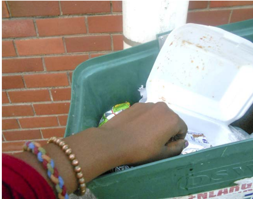
Photograph 3: “I upgraded our family”

Such notions of HE as enabling social mobility are not particular to this context (Southgate et al. 2017). While a recent study of US HEIs acknowledged that intergenerational income mobility impacts access to the top tier institutions, the rates of upward mobility are higher in institutions that enable access to opportunities for students who in the majority come from lower socio-economic backgrounds (Chetty et al. 2017). Similarly, the HBI in this study primarily serves students from low-income backgrounds with lower submission selection criteria. What the narratives of these participants revealed was that this characterisation, of the university affording financial opportunity, was inherited from familial expectations. As a FGS, Stanley assumed the duty as an important part of his family as a potential breadwinner, noting that, “I am the first one to attend a university ... and they are reminding me of the purpose of me doing this.”