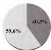
Graphic 1: Exposure of academic distinction

The vast majority of schools that implement practices of academic distinction hold a public ceremony to present the awards and diplomas (83%), with the presence of students, parents and guardians, representatives from the local community and, in many cases, the media. In spite of the compliance with this ritual, as a general rule, the format and the symbolic charge conferred by the school community to this moment is different, as it can be held at the end of a school day, or be strategically performed during an entire day, framed by various initiatives and events and culminating with the ceremony of delivering awards or diplomas to the best students.