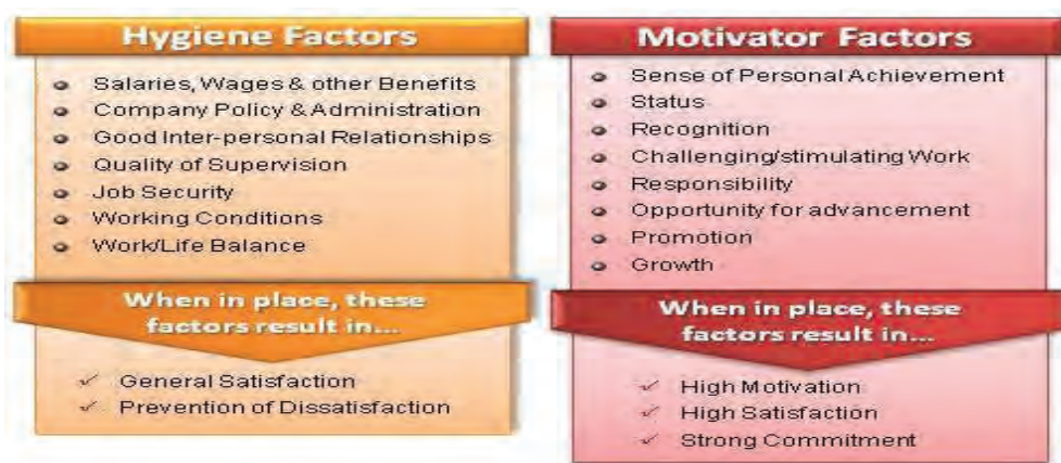
Figure 1: Herzberg's Theory of Motivation

which are process approaches and content theories. Examples of each category include: Maslow's Hierarchy of Needs, Alderfer's ERG needs, Equity theory, Expectancy theory, Goals setting theory etc. This study only adopted Herzberg's Theory of Motivation, which is a content theory. This content theory was chosen as it tries to establish the relationship between motivation and performance of employees (Lamprey, Boateng and Antwi 2013). The study questions were adopted from Herzberg's theory.