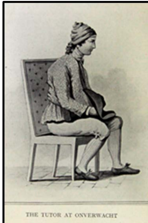
Figure 3: Sketch of Carel David Wentzel by Lady Anne Barnard.