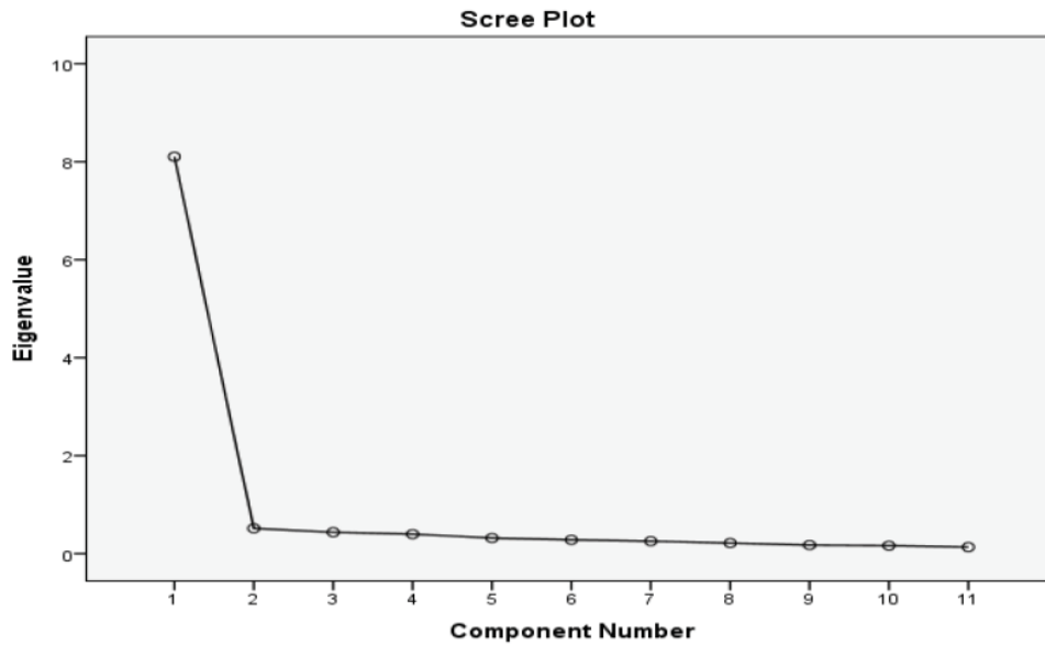
Figure 2: Scree plot

above the elbow contributes the most to the explanation of the variance in the data set (Catell 1966) and thus provides further evidence of a single factor structure.