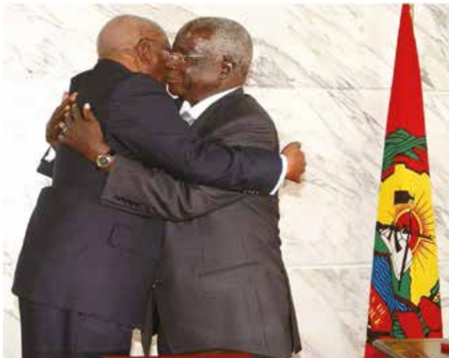
Figure 3: President Armando Guebuza

Concerning resources, Homerin wrote: 129 ‘The CCM established ongoing partnerships with international NGOs.’ 130