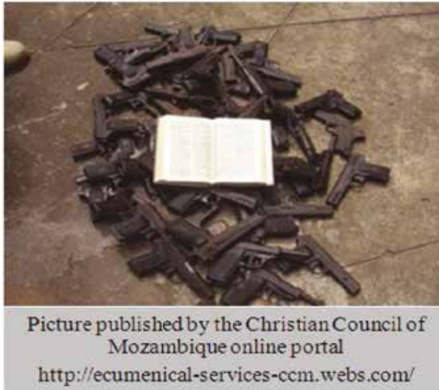
Figure 2: Weapons

Concerning resources, Homerin wrote: 129 ‘The CCM established ongoing partnerships with international NGOs.’ 130