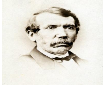
Figure 2: Picture of David Livingstone 8

Commenting on Livingstone's 3 Cs theory, Nkosazana said: