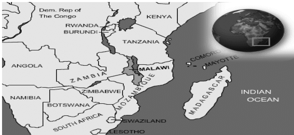
Figure 1: Map of Malawi and neighbouring countries

Lying in the south and southeast of Tanzania, the west, north and north-south of Mozambique, and the east of Zambia is a small landlocked country called Malawi [previously named Nyasaland] (Cullen 1994:9; Ross 1996:15). The country is 901 kilometres long and ranges in width from 80 to 161 kilometres and it has a total area of 118,484 square kilometres, making it the smallest countries of its neighbours in southern Africa (Douglas at. el. 2003:30). Arguably this article proposes that though Malawi's geographical location did not contribute directly to the labour migration, the country's central location in southern Africa might have made South Africa easily accessible by Malawians who believed that labour migration provided a vital economic lifeline for their families (Delius 2014: 315).