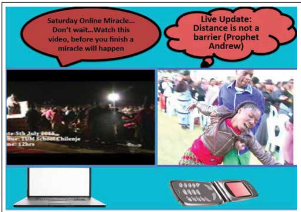
Figure 2: Examples of healing methods

The study established that the methods of healing disabilities had also transformed with technological advancements as people with disabilities were promised healing even via radio, television, the Internet and phone, as shown in figure 2 below. This observation and interpretation of what was happening on the ground is consistent with the interpretive principles, which advance that subjective meanings of the participants of reality are influenced by historical and social contexts (Creswell 2007).